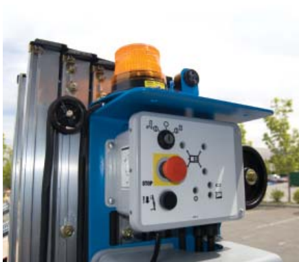
Operational Warning Light