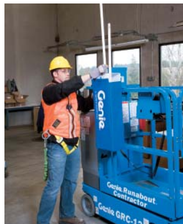
Fluorescent Tube Caddy (only available on narrow or standard platform)