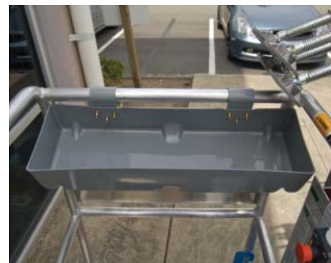
Work Station Tray (not available on narrow or ultra-narrow platforms)